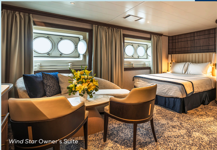
Wind Star Owner's Suite