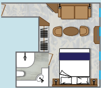
WIND SPIRIT OWNER'S SUITE