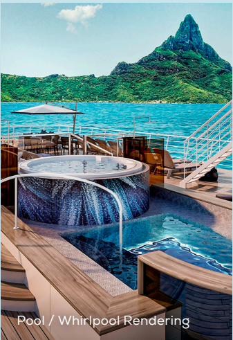
Pool / Whirlpool Rendering